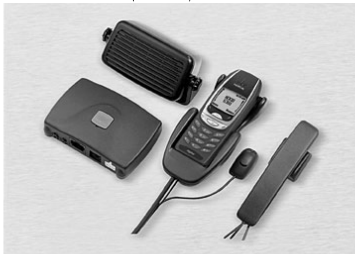
Figure 2: Advanced Car Kit (CARK-91H) with HSU-1 handset. Note: transceiver NOT included.