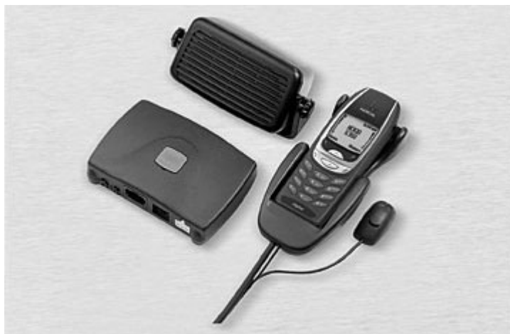
Figure 1: Advanced Car Kit (CARK-91). Note: transceiver NOT included.